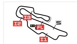
Autodromo Internazionale del Mugello 5245 m.